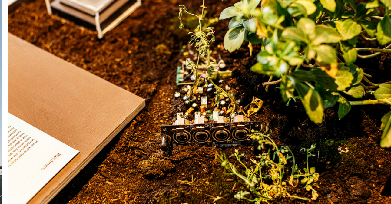
Central Saint Martin — Material Futures