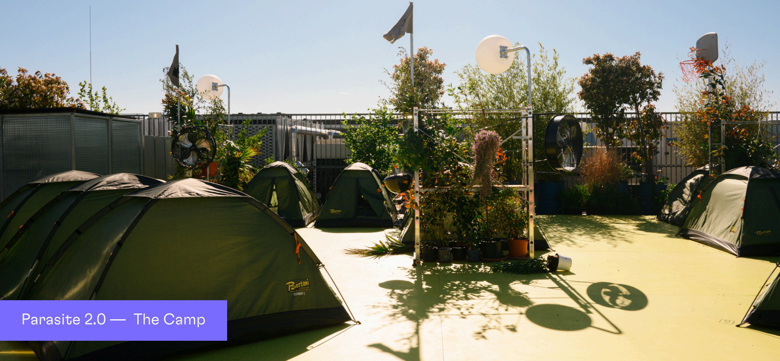
Parasite 2.0 — The Camp