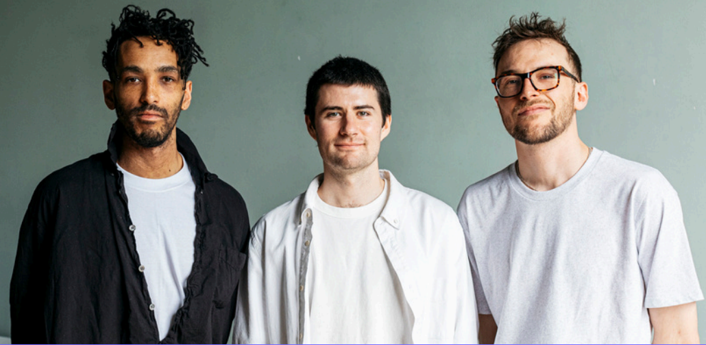
Computer Room — Found in translation