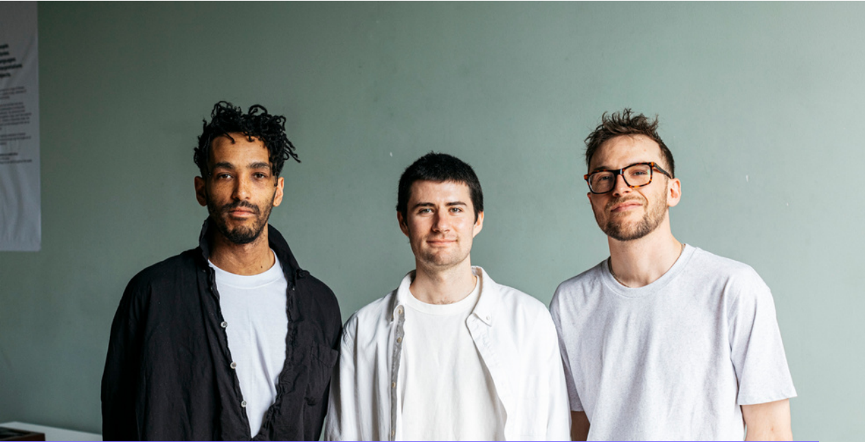
Computer Room — Found in translation