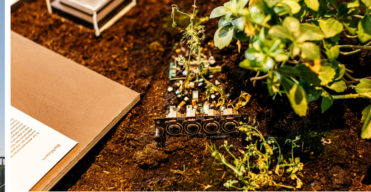
Central Saint Martin — Material Futures