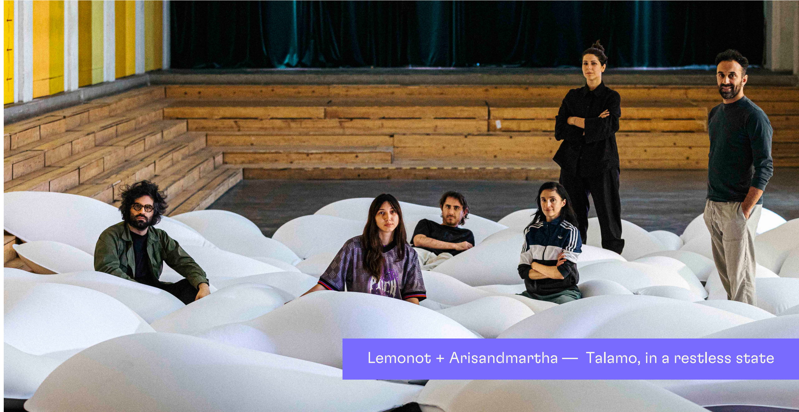
Lemonot + Arisandmartha — Talamo, in a restless state