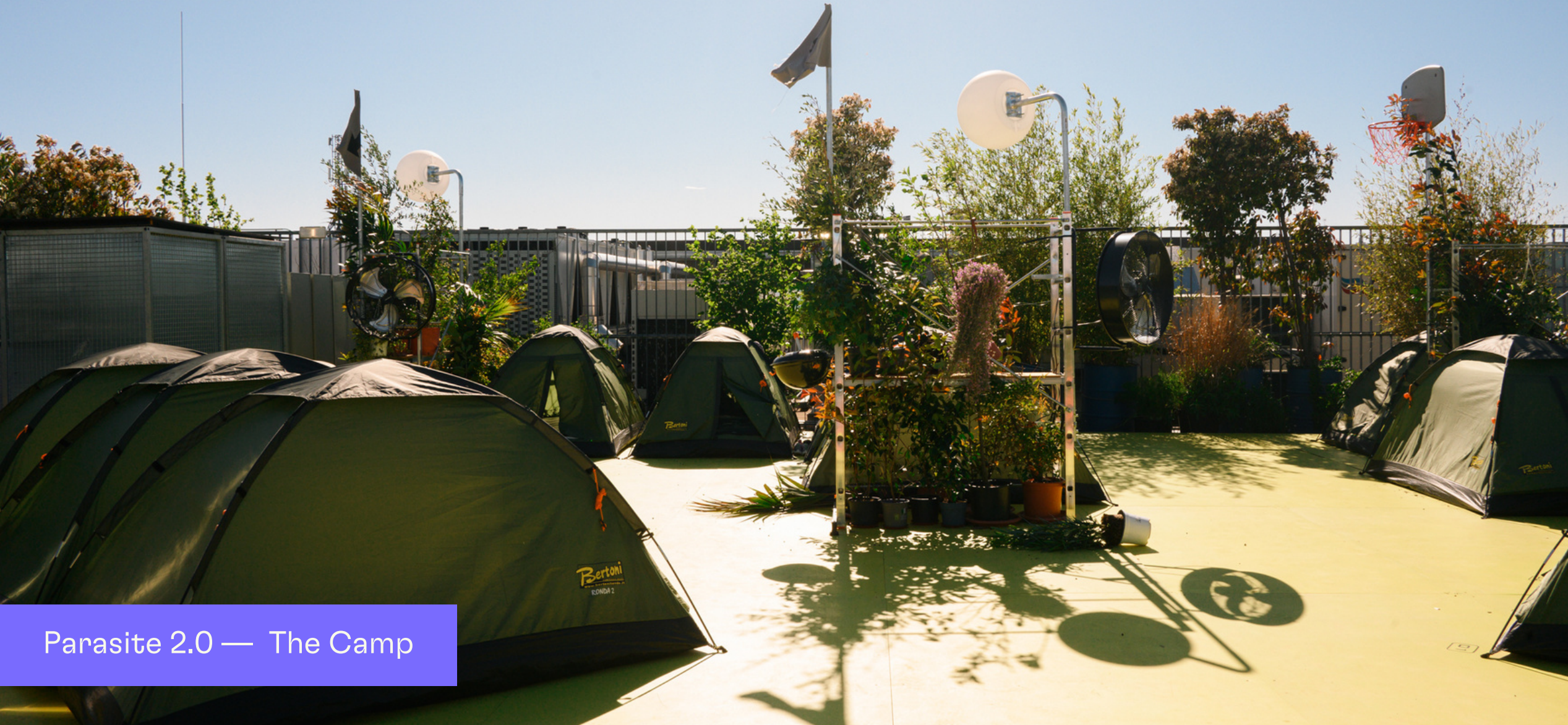
Parasite 2.0 — The Camp