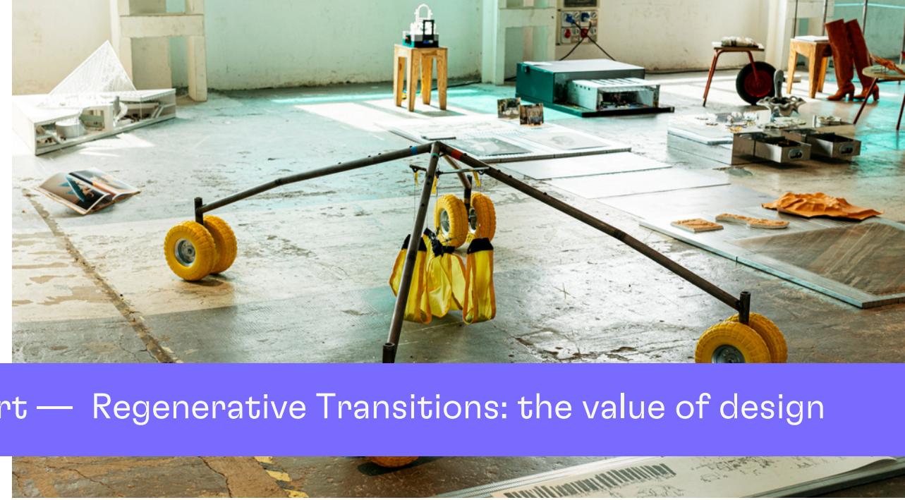
The Royal College of Art — Regenerative Transitions: the value of design